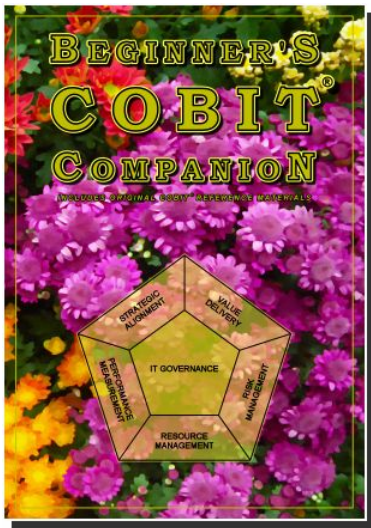
Beginner's COBIT Companion